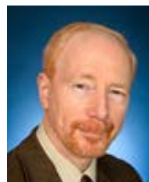
Robert A Neimeyer

On the one hand, grief following the death of a significant attachment figure is a normal human response, that should not be considered a psychiatric disorder. However, an enormous body of research in many countries has led the World Health Organization (2019) to recognize Prolonged Grief Disorder in its most recent edition of the International Classification of Disease (the ICD-11) as a stress-related condition distinguishable not only from adaptive grieving, but also from depression, anxiety, and posttraumatic stress disorders (see Table 1). In this form of life-vitiating, protracted and anguishing response to loss, mourners struggle with turbulent emotions of longing, guilt, loneliness and desolation which tangibly impair their ability to function in the contexts of family, work and the